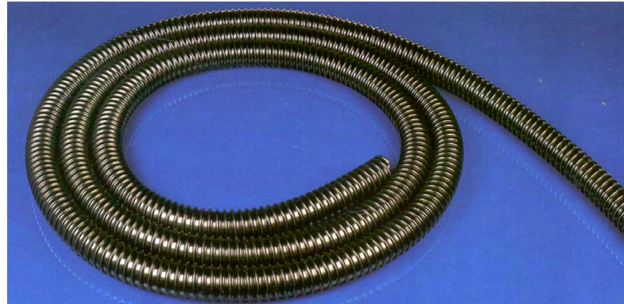
Electrically conductive polyurethane with PU-coated spring steel wire