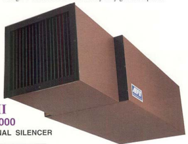
JAWS™ II MODEL 1000 WITH OPTIONAL SILENCER

In addition to tobacco smoke, the 1000 is ideal for removing dust and dirt from lab, computer rooms where paper dust is a problem, photo laboratories, and other area where dust particles can be a problem. A 1/2" charcoal filter is standard for reduction of light odors. More significant odors and gases can be removed by ordering the optional 2" thick charcoal adsorber allowing both particle and odor/gas removal in one unit. Rounding out the options area HEPA filter option for ultra clean requirements, and a large V-bank adsorber for heavy duty gas adsorption.